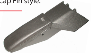
RH 6" or 8" WING-BASE

R & H WING BASE ripper points have a rear-mounted solid cast Chrome Alloy 6" or 8" wing with 30 degrees of lift and 45 degrees of reverse dihedral. These points give a more rolling stir to the soil. Soil is lifted and pushed to the side in a more aggressive action. R & H Wing Base points are commonly used on front-row applications with 10" wings following.