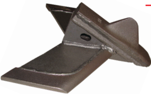
RH FLAT WING

R & H FLAT WING uses our signature Chrome Alloy weld-on strips inserted on the front edge of a high strength T-1 steel wing built into the structure of the ripper point. It is designed to fit the Dammer-Diker or similar equipment running in light soils where a wider work bed is required. The wing runs almost level at the bottom of the shank, resulting in a cutting rather than lifting action.