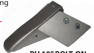
RH 10" BOLT-ON REPLACEABLE WING

R & H BOLT-ON 10" WINGS are mounted onto the rear of the point with a fabricated bracket. Wings are cast from solid Chrome Alloy with hex bolt-holes for ease of installation and replacement. Wings run at a 32 degree angle with 40 degrees of reverse dihedral to give a violent and complete stir, resulting in a "marbling" of the soil to help prolong fracture. R & H Machine offers 10" winged points for most brands of rippers. Some brands may require the removal of one of the wings for access to the mounting pin or bolt. RH 98 BW bolt-on wings may be ordered separately for replacement, or for use with new R & H frogs. RH 98 BW bolt-on wings will also fit DMI frogs.